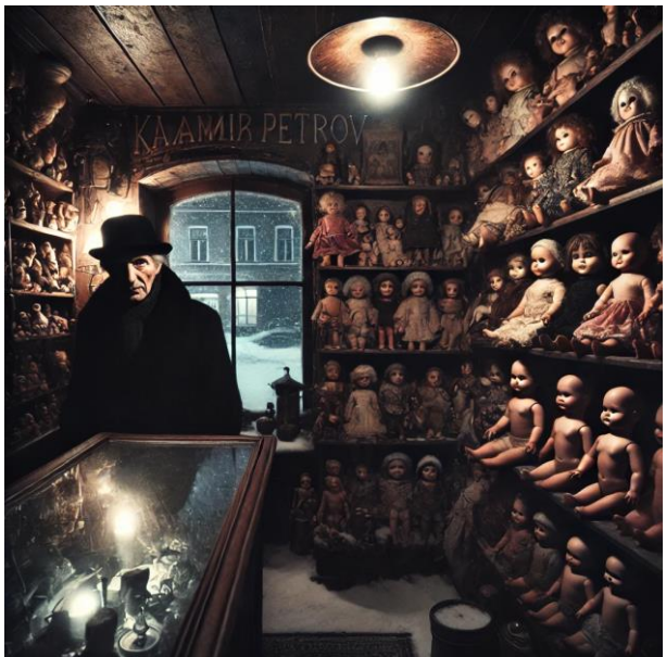
The mysterious toy shop in Moscow

The police took Petrov away, and the toy shop closed forever. The children went home to their families. From that day, everyone in Moscow remembered the story of the evil toymaker. And children learned to never trust strangers who give them sweets.